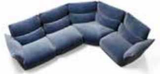
Configuration Sectional with 90° corner