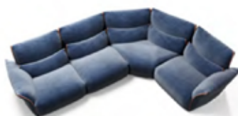
Configuration Sectional with 90° corner