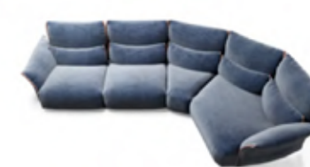
Configuration Sectional with terminal

Their home is spacious and welcoming, as is their Wellbe configuration, which they have chosen for its unparalleled comfort – particularly when those first little back aches occasionally appear – and its ability to accommodate friends and family when they come to visit. In addition, the side pocket of Wellbe is perfect for storing their tablet, their favourite magazines and the TV remote. All at hand for a quiet evening at home.