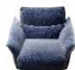
Configuration Recliner Lovechair

But when they are home, they love to cocoon, this is why they chose this configuration of Wellbe. The lovechair allows them to share moments of intimate comfort together and recharge the energies of both body and mind.