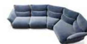
Configuration Sectional with terminal