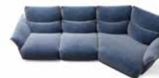
Configuration Two seater + terminal (with/without motion)